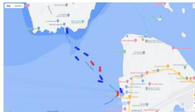
Figure 3. SEAWAVEs monitoring dashboard showing real-time vessel tracking and monitoring activities.

In addition to accident prevention, the monitoring platform contributes to environmental awareness by providing users with real-time situational information. The availability of tracking information, sea condition data, and alert notifications promotes proactive decision-making and encourages responsible vessel operation. Similar benefits were reported in previous studies that highlighted the system's role in supporting safe and sustainable marine activities, particularly within tourism-oriented coastal environments such as Boracay Island [18]. Figure 3 presents the SEAWAVEs monitoring dashboard used for real-time vessel tracking and situational monitoring. The interface provides users with visual information regarding vessel location and movement, thereby supporting timely decision-making and enhanced operational awareness.