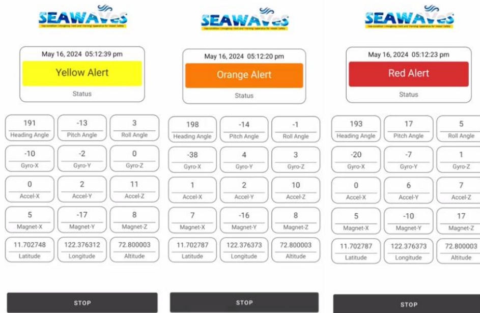
Figure 2. SEAWAVEs alert interface showing Yellow Alert, Orange Alert, and Red Alert conditions generated from real-time vessel monitoring parameters.

In addition to accident prevention, the monitoring platform contributes to environmental awareness by providing users with real-time situational information. The availability of tracking information, sea condition data, and alert notifications promotes proactive decision-making and encourages responsible vessel operation. Similar benefits were reported in previous studies that highlighted the system's role in supporting safe and sustainable marine activities, particularly within tourism-oriented coastal environments such as Boracay Island [18]. Figure 3 presents the SEAWAVEs monitoring dashboard used for real-time vessel tracking and situational monitoring. The interface provides users with visual information regarding vessel location and movement, thereby supporting timely decision-making and enhanced operational awareness.